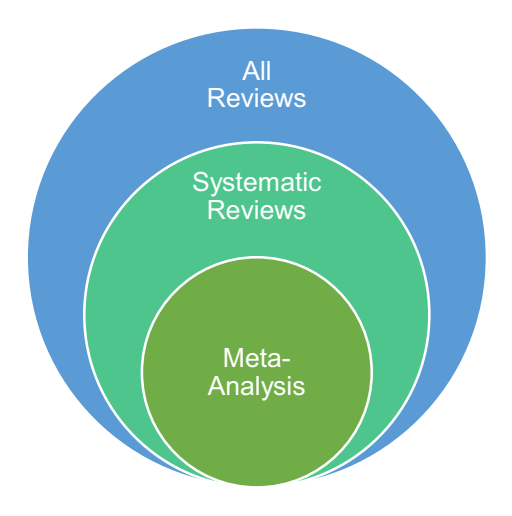
Fig. 1 Visual depiction of research reviews

Within the context of systematic reviews, a meta-analysis is "a set of statistical techniques for synthesizing the results of multiple studies. Such techniques are used when the guiding research question focuses on a quantitative summary of study results" (Pigott and Polanin 2020, p. 24). Pigott and Polanin (2020) recommend the following best practices while conducting a meta-analysis, (a) developing a research question for a meta-analysis; (b) searching all eligible studies; (c) unbiased screening of abstracts and full-text; (d) coding important moderators of effect size variability; and (e) computing and reporting all effect sizes. Some meta-analyses focus on estimating a treatment effect in a set of experimental studies, whereas others focus on estimating the magnitude and direction of an association between two variables. Though time-consuming, meta-analyses add value for future researchers, practitioners, and policymakers. Figure 1 shows a visual of reviews. As is clear from that figure, while all meta-analyses are systematic reviews, not all systematic reviews are meta-analyses.